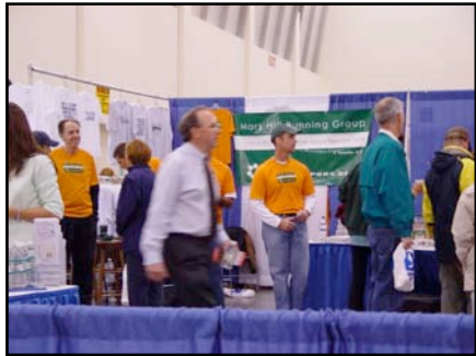
top: The Setup bottom: The Delivery

We had 30 people sign up to receive the weekly club news and had several new faces at the Monday and Tuesday group runs. I am sure many on Saturday heard people running around them comment on the orange shirts that they had become familiar with from the booth.